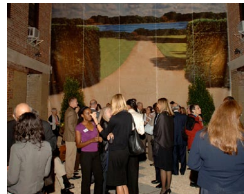
Opening night reception

For more information about the services offered by the Department of Psychiatry and Behavioral Health at SLR, please visit: http://www.slropsych.org or call: (212) 523-7342.