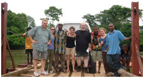
CFI React on the road in Africa.

Department of Psychiatry & Behavioral Health