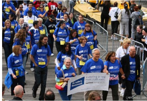
The St. Luke's Roosevelt Team walks with pride across the Brooklyn Bridge.