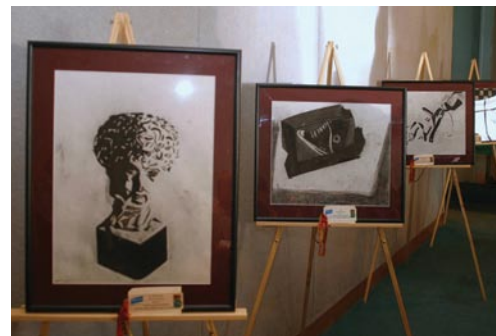
Charcoal drawings by Karen Z.

(Please note this is a partial listing due to the ongoing increasing exposure of the Department in the media.)